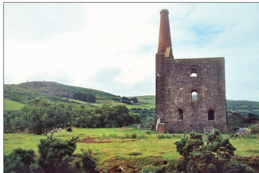
The engine house at the Prince of Wales Shaft, Phoenix United, with Cheesewring Quarry in the background.