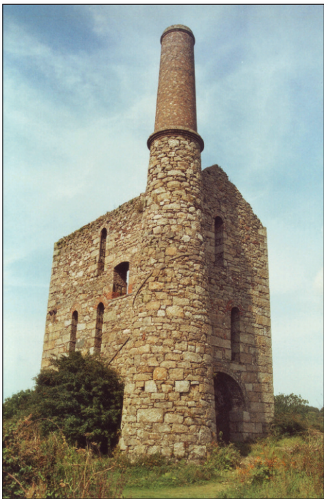
The pumping engine house at Pascoe's Shaft, South Wheal Francis, erected in 1887, stands beside the path.