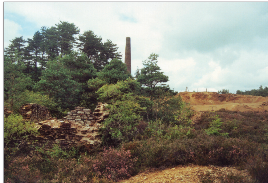
The chimney that served the arsenic flues, as well as ruined buildings at Wheal Josiah. Once a water wheel stood where the photograph was taken.