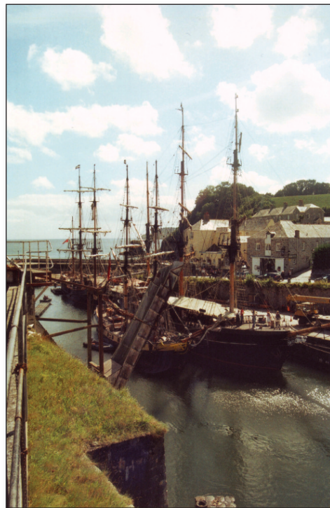
Charlestown Harbour. An evocative scene, for it is now home to the 'Square Sail' fleet.